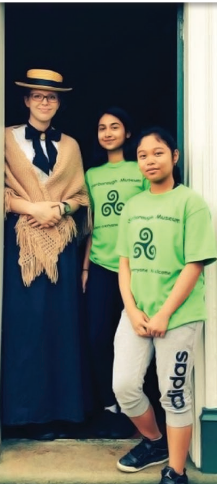
Staff and volunteers at Scarborough Museum

MACKENZIE | CONFIDENCE Investments IN A CHANGING WORLD