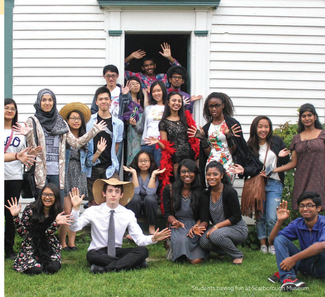
Students having fun at Scarborough Museum

As the cold winter months approach, learn how the birds, plants and animals in the Wildflower Preserve prepare for the season.