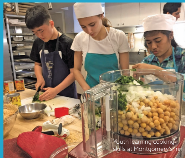
Youth learning cooking skills at Montgomery's Inn

Celebrate Halloween traditions of the past. Tour the historic homes, sample old-time treats and make a creepy craft. Costumes encouraged!