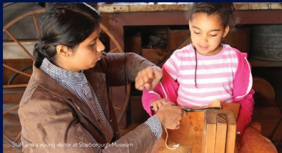
Staff and a young visitor at Scarborough Museum

Learn the personal stories of several Eaton's employees who fought in the First World War, and see how the Great War transformed Canada.