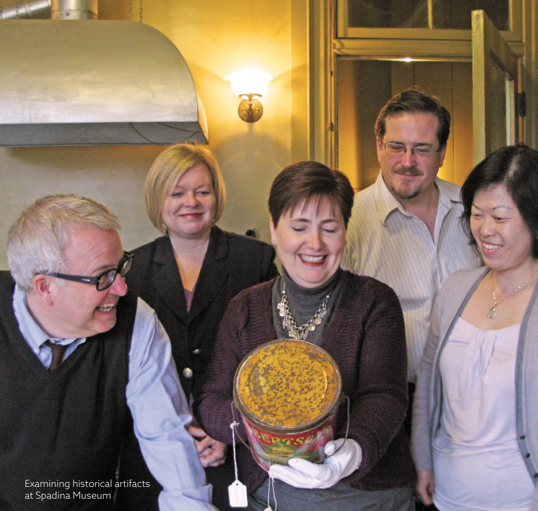
Examining historical artifacts at Spadina Museum